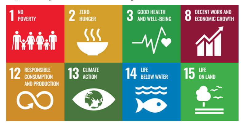
Figure: Major Sustainable Development Goals in relation to PAHW

Since the challenges described above are not restricted to the European continent, networking with international projects and initiatives will be sought and international cooperation